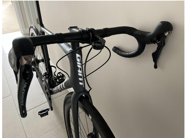
Crankset & Handlebars

Please attach any additional images of damage to the bicycle.