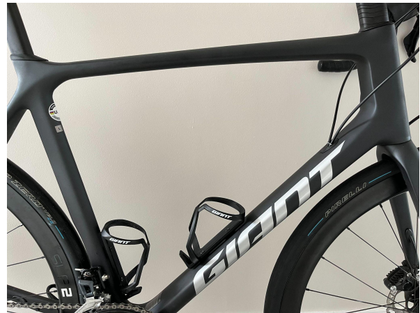
Close up of frame - left & right hand side