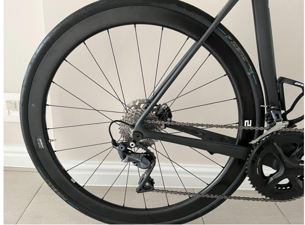
Rear wheel - left & right hand side