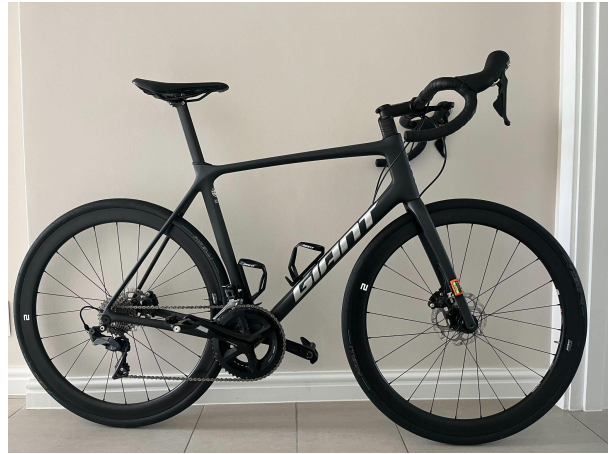
Full bicycle - left & right hand side